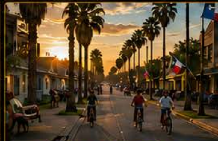
ROOTED IN OUR STREETS The Valley is home.