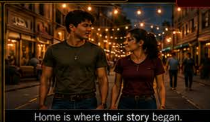
Home is where their story began.