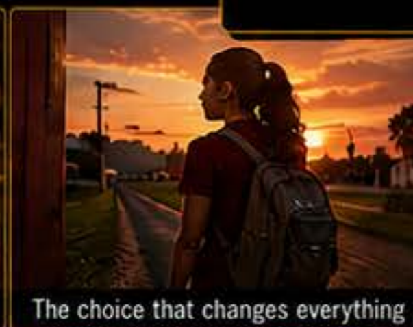
The choice that changes everything