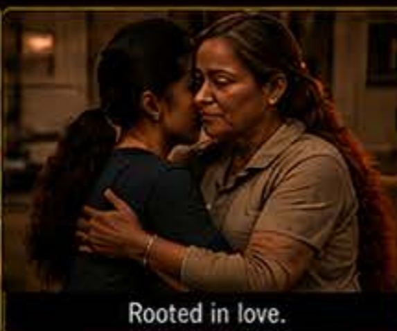
Rooted in love.