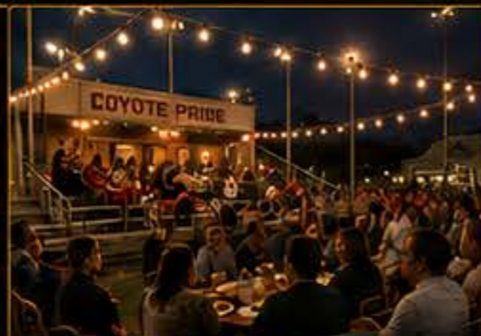
COMMUNITY SPIRIT Friday nights and lasting memories.