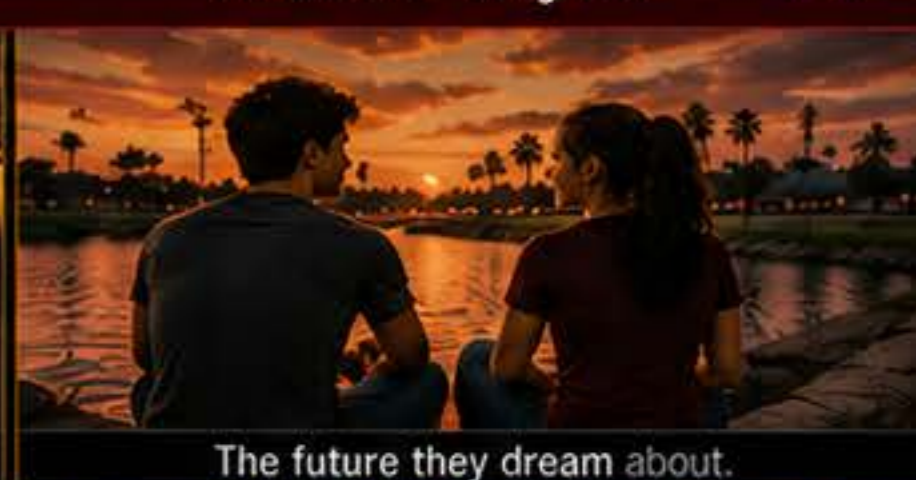
The future they dream about.

★ SOMETIMES THE HARDEST GOODBYES ARE THE ONES YOU NEVER EXPECT TO SAY. ★