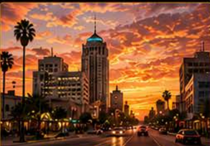
DOWNTOWN MCALLEN Community. Culture. Progress.