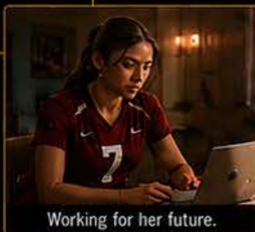
Working for her future.