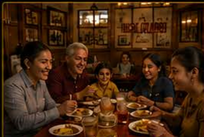
FAMILY TRADITIONS Food that brings us together.