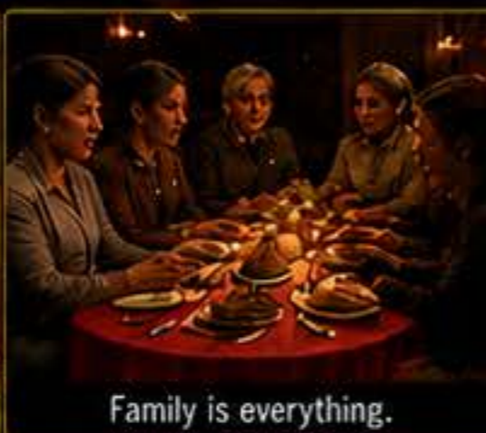
Family is everything.