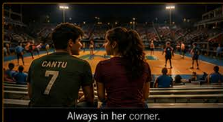
Always in her corner.

“ Sometimes the best things in life are already right in front of you. ”