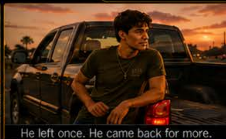
He left once. He came back for more.