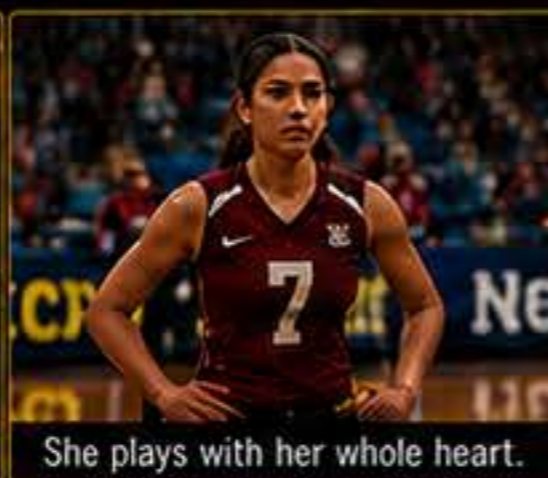
She plays with her whole heart.