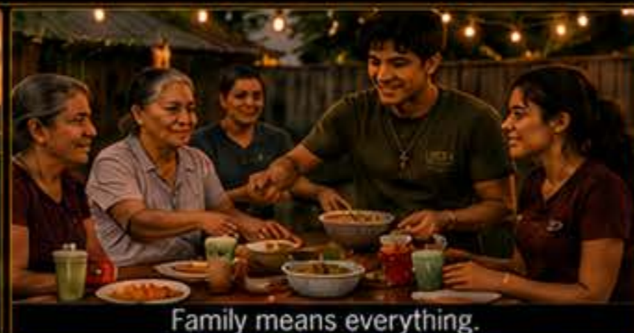
Family means everything.