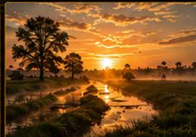
BEAUTY IN EVERY DAY Sunrises. Strength. New beginnings.

“ Your mother left like a storm. You will leave like a sunrise. ”